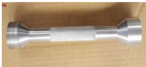
FNE - 14" FAN NOZZLE EXTENSION. ($299.00)