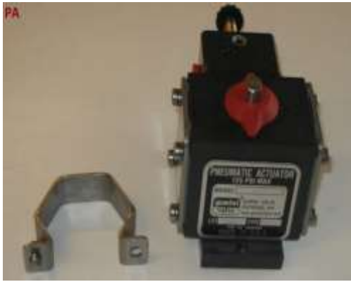
PA – PNEUMATIC ACTUATOR. ($225.00)