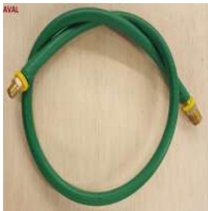
AVAL – ACTUATOR VALVE AIR LINE. ($22.00)