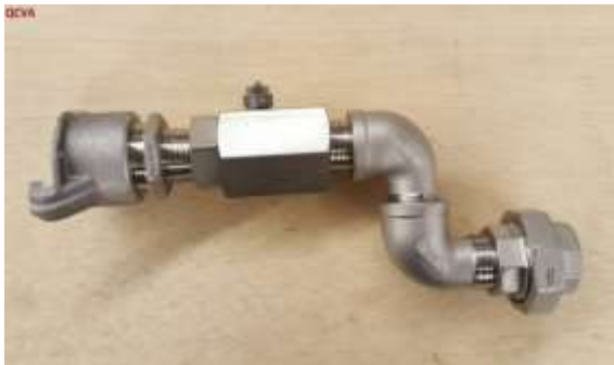
QCVA – QUICK CHANGE VALVE ASSEMBLY. ($200.00)