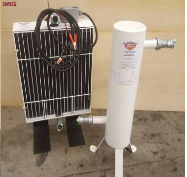
SWSCS – IS THE SINGLE FAN COOLER AND SEPARATOR UNIT THAT INCLUDES (1) 15' HIGH TEMP HOSE AND (2) 10' JUMPER HOSES. ($2,700.00)