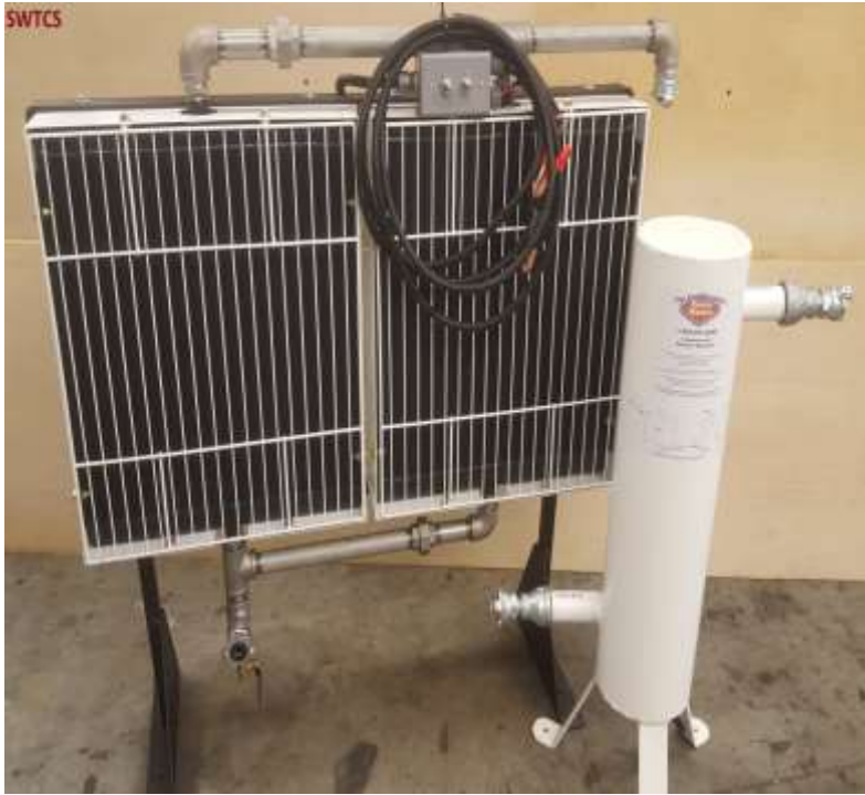
SWTCS – IS THE TWIN FAN COOLER AND MOISTURE SEPARATOR PACKAGE THAT INCLUDES (1) 15' HIGH TEMP HOSE AND (2) 10' JUMPER HOSES. ($4,800.00)