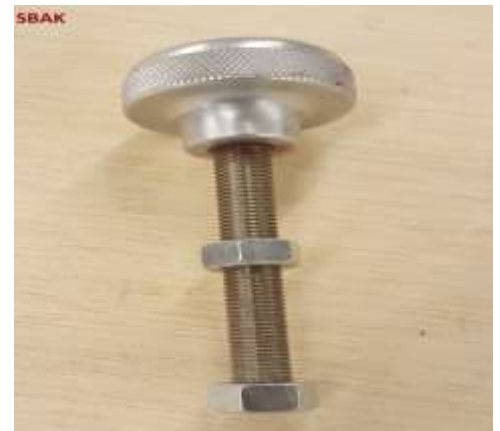
SBAK – POT ADJUSTMENT KNOB. ($43.00)