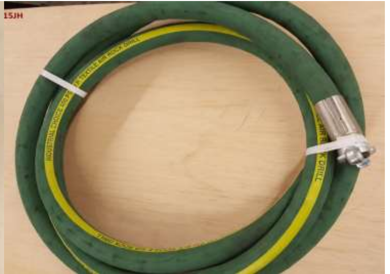
15JH – 15' HIGH TEMP JUMPER HOSE. ($125.00)