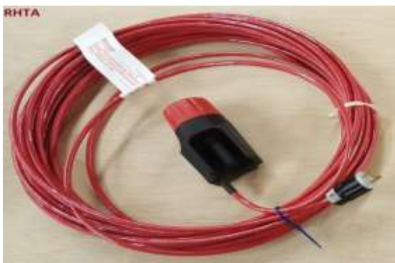
RHTA – 12 VOLT TRIGGER ASSEMBLY. 55' CORD ($370.00)