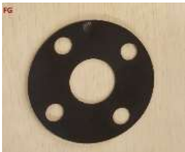
FG - FLANGE GASKET ($8.00)