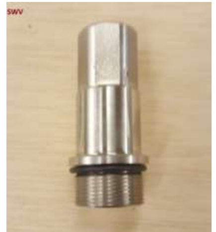
SWV - SODAWORKS VENTURI ($100.00)