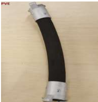
PVE – 18" PINCH VALVE EXTENSION HOSE. ($45.00)