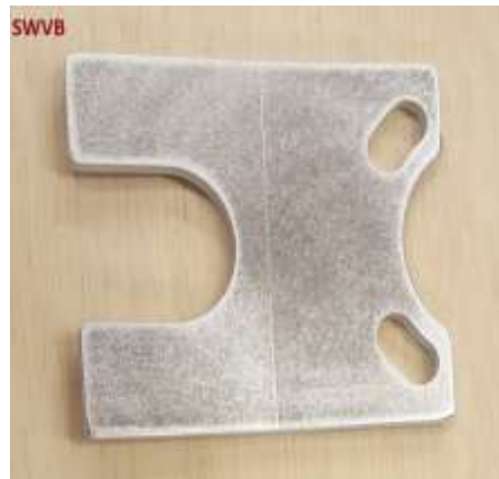
SWVB – VALVE BRACKET. ($36.00)