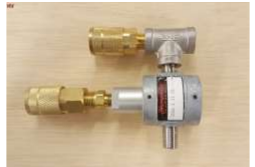
HV – HUMPHRY VALVE. ($159.00)