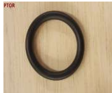
PTOR - PASS THRU O-RING ($6.00)