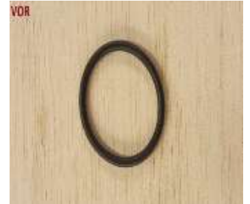
VOR - VENTURI O-RING ($6.00)