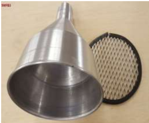
SWF&S - FILL FUNNEL AND SCREEN. ($199.00)