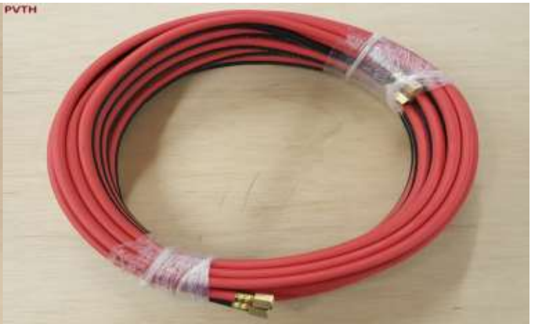
PVTH – PINCH VALVE TRIGGER HOSE. (TWIN LINE) ($110.00)