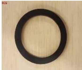
FCG - FILL CAP GASKET ($6.00)