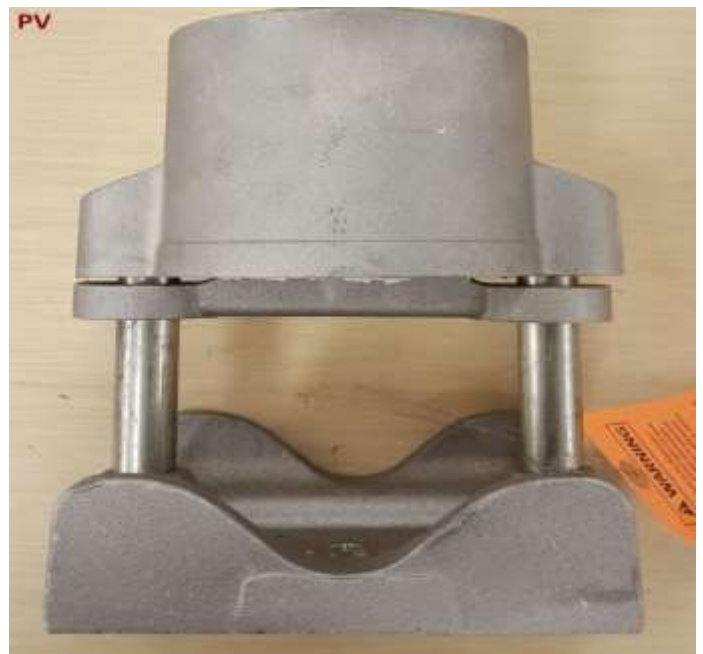
PV – PINCH VALVE. ($295.00)