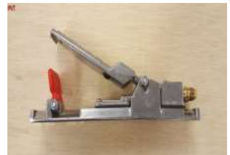
PVT – PINCH VALVE TRIGGER. ($100.00)