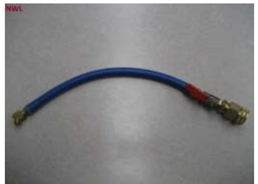
WNL – 12" WET NOZZLE WATER LINE. ($37.00)