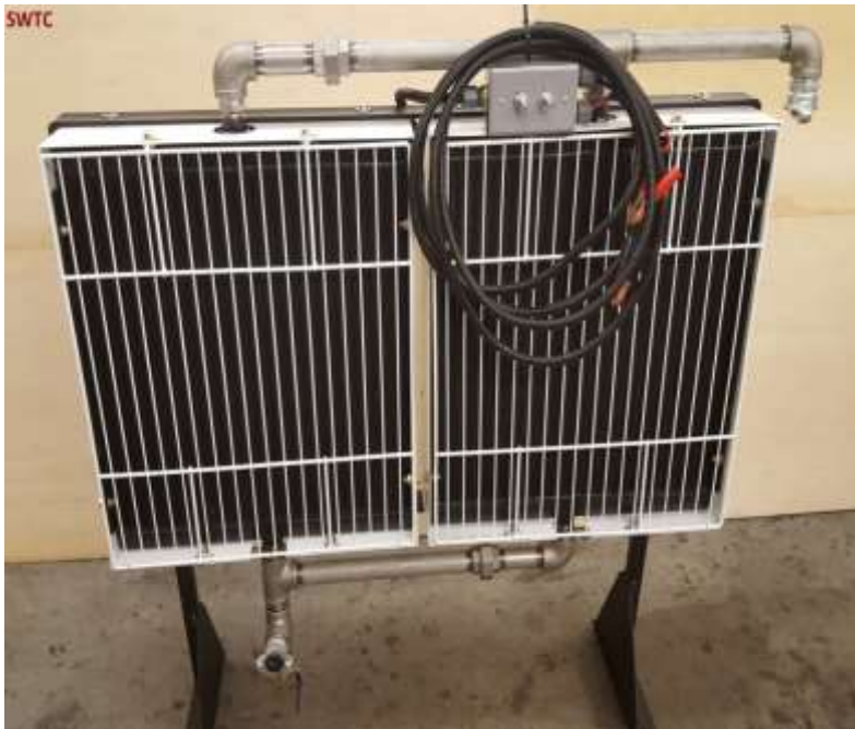
SWTC – TWIN FAN COOLER UNIT (375 CFM) COMES WITH (2) 10' JUMPER HOSES. ($4,300.00)