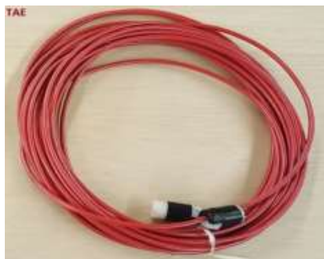
TAE – 12 VOLT TRIGGER EXTENSION. 55' CORD ($220.00)