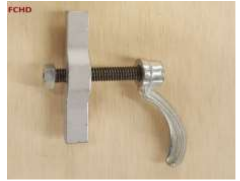
FCHD – FILL CAP HOLD DOWN. ($60.00)