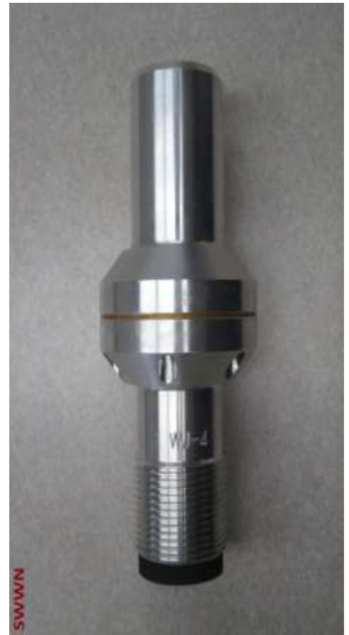
SSWN – WATER INJECTION NOZZLE. #3 – 3/16" OPENING ($400.00) #4 – 1/4" OPENING ($425.00) #5 – 5/16" OPENING ($455.00)