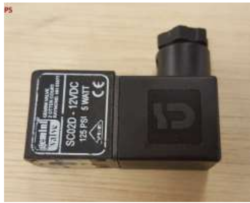
PS – POWER SOLENOID. ($195.00)