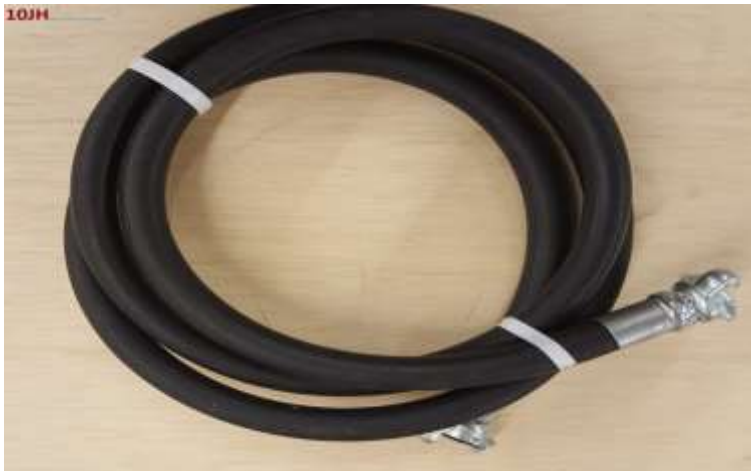
10JH – 10' JUMPER HOSE. ($50.00)