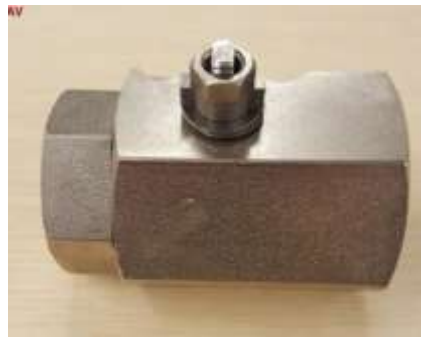
AV – ACTUATOR VALVE ONLY. ($120.00)