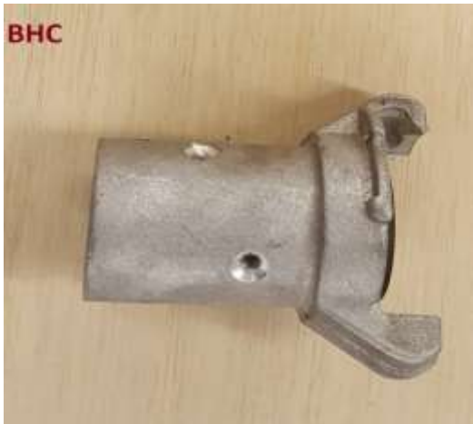
BHC - BLAST HOSE COUPLER ($30.00)