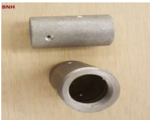
BNH – BLAST NOZZLE HOLDER (1). ($37.00)