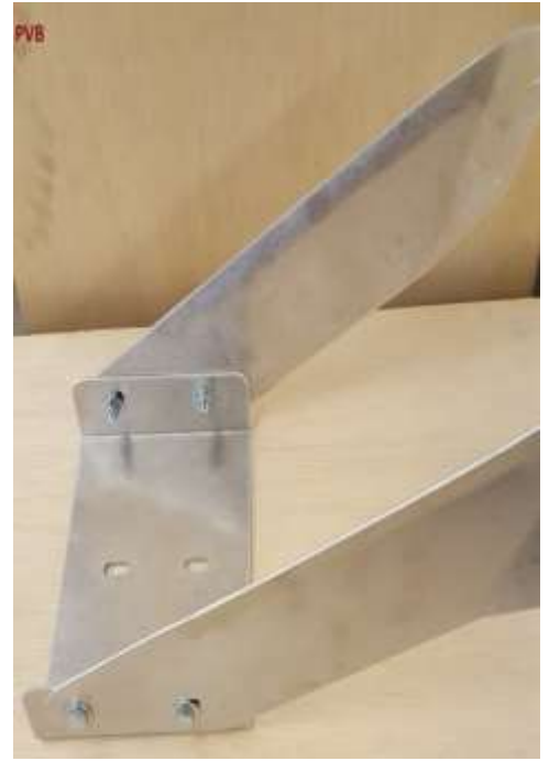
PVB - PINCH VALVE BRACKET ($295.00)