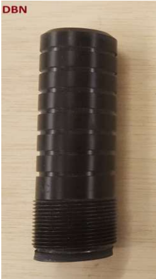
DBN – DRY BLAST NOZZLE. #3 – 3/16" OPENING ($115.00) #4 – 1/4" OPENING ($115.00) #5 – 5/16" OPENING ($125.00)