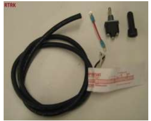
RTRK – TRIGGER REBUILD KIT. ($65.00)