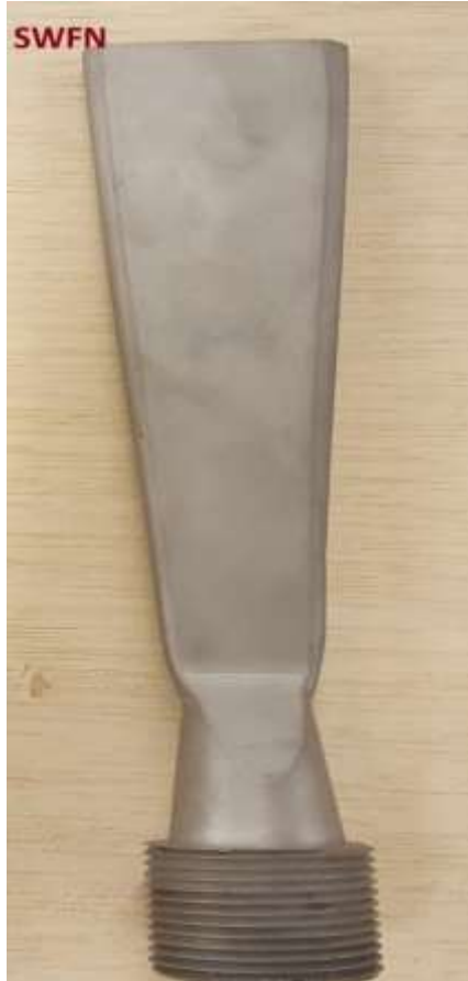
SWFN – FAN NOZZLE. ($495.00)