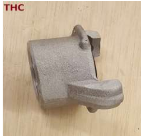
THC - THREADED HOSE COUPLER ($32.00)