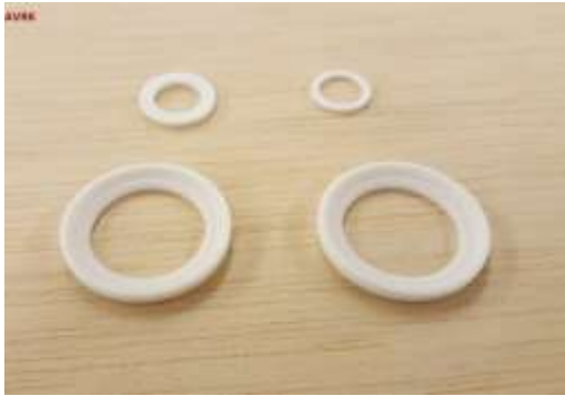
AVRK – ACTUATOR VALVE REPAIR KIT. ($34.00)