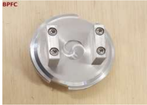
BPFC – BLAST POT FILL CAP. ($110.00)