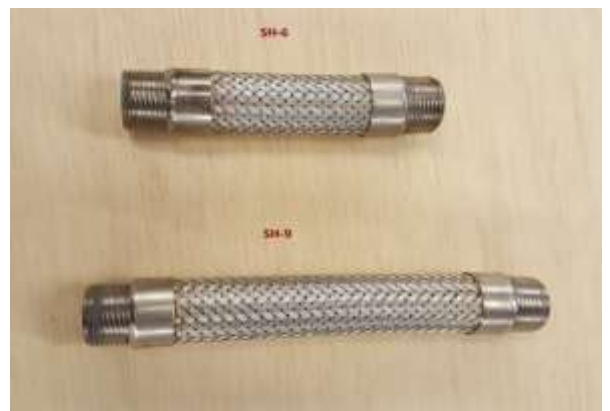
SH-6 – 6" STAINLESS FLEX HOSE. ($110.00) SH-9 – 9" STAINLESS FLEX HOSE. ($122.00)