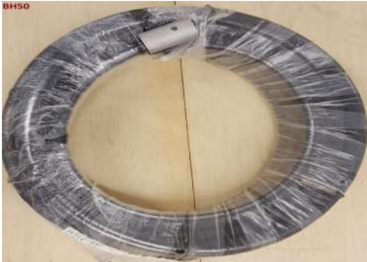
BH50 – 50' BLAST HOSE WITH NOZZLE HOLDER OR TWIN CHICAGO COUPLERS. ($340.00)