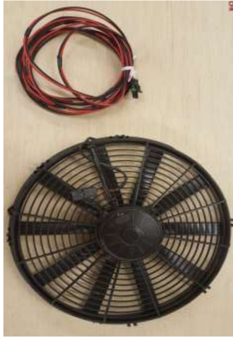
CFR - COOLER FAN REPLACEMENT ($75.00)