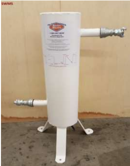
SWMS - MOISTURE SEPARATOR ($660.00)