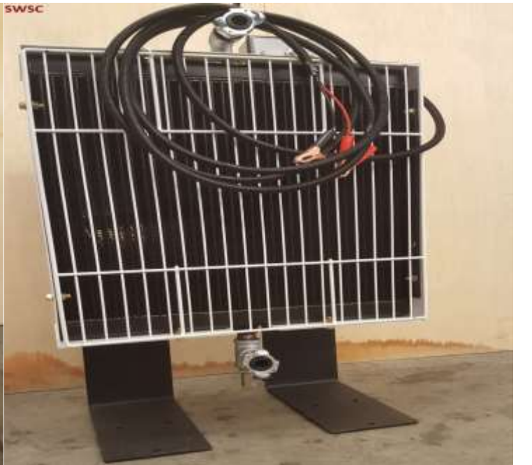
SWSC – SINGLE FAN COOLER (180 CFM) COMES WITH (2) 10' JUMPER HOSES. ($2,200.00)